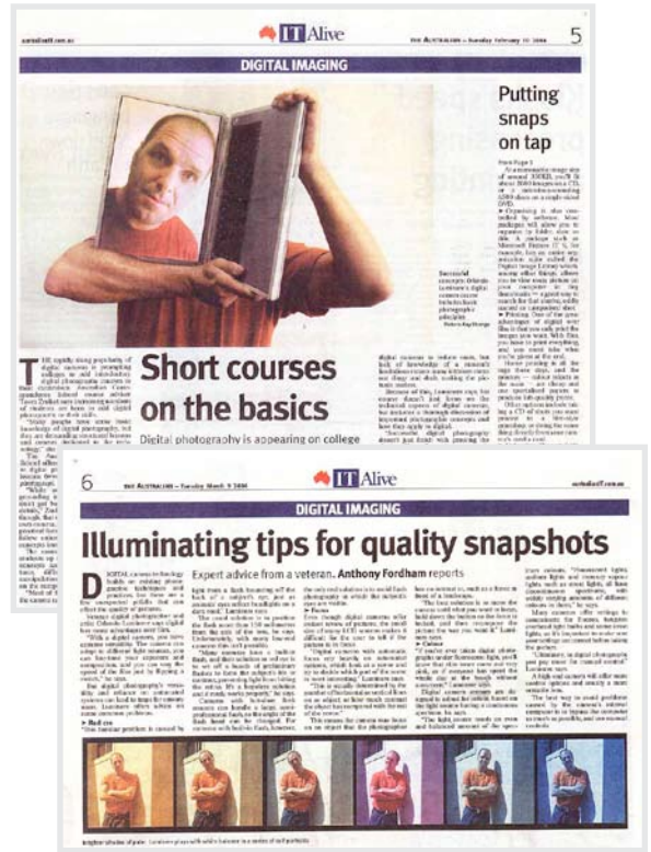
articles in The Australian

"Conducted course in interesting fashion & encouraged participation, questions etc. Very Impressive." Most valuable part of the course: "Camera features," Least valuable part of the course: "NA" David New