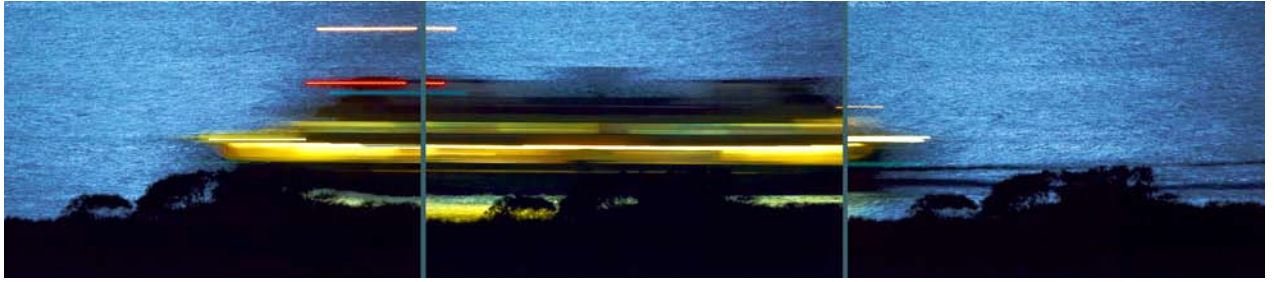
Manly Ferry Passing Dobroyd Head at Night

Beginners and New to Digital SLR Cameras