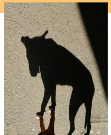
seeing photographs (look at it upside down)

* having a digital camera with a manual exposure mode is important for this course as it will let you learn "hands on"