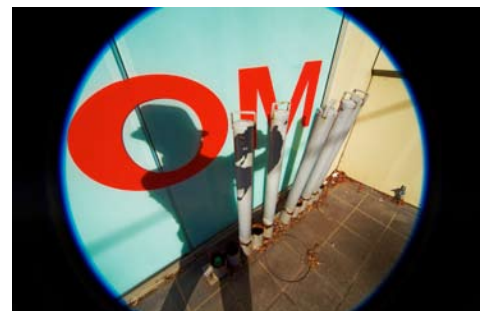
seeing the unusual in the commonplace